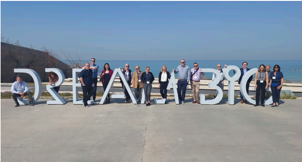
Health Tech Delegation 2023 visiting the Shimon Peres Innovation Center in Tel Aviv

In late 2023, the MIBA initiated a Delegation Sponsorship Program with the William Davidson Foundation to boost representation of diverse companies in our Israel delegations. This sponsorship covers registration and partial airfare for revenue-generating startups in Southeast Michigan aligned with the delegation sector. A sponsorship was granted to a Women in Mobility delegate, though their trip slated for late October was postponed.